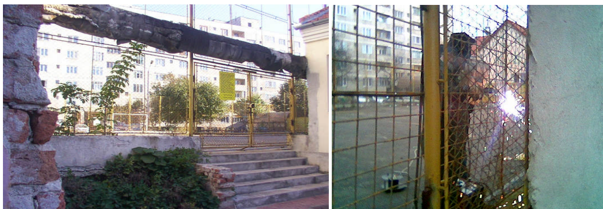
The sports-ground "behind bars": much spoken about openness and Christian love – while welding bars on stolen property

During communism , the Orthodox Church "expanded" by seizing thousands of church properties and NEVER restoring rightful ownership to the minority churches in Romania. In addition, since 1989 , more than 2,000 Orthodox churches and some 40 monasteries have been built with public funds in Transylvania's non-Orthodox regions.