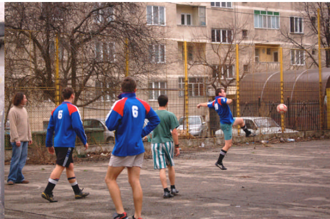
Civil obedience: Lorántffy students vs. Reformed Church team on the confiscated sports-ground