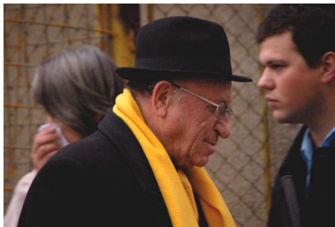
While “secretly” photographed from the Orthodox manse... and inspected on the spot.