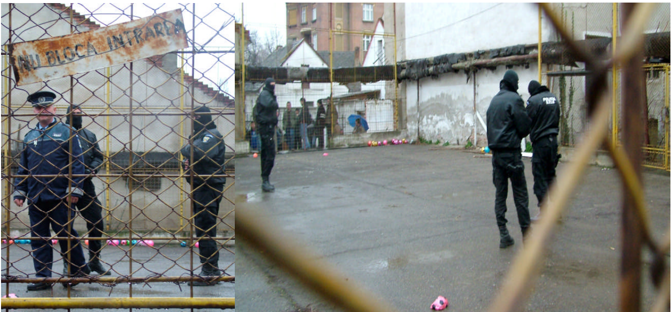
The old, rusty sign says: “DO NOT BLOCK THE ENTRANCE!”

Previous Transylvanian Monitor issues are available at: www.emnt.org