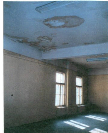
Condition of the classrooms of the Lorántffy High School upon restitution

416 Hungarian-speaking Reformed students attend the Lorántffy High School. The Reformed Church has spent huge amounts of money on renovation, from its own resources and international donations.