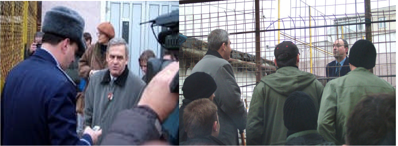
Déjà vu – 1989: László Tőkés and Reformed Church members threatened by an arrogant police officer.