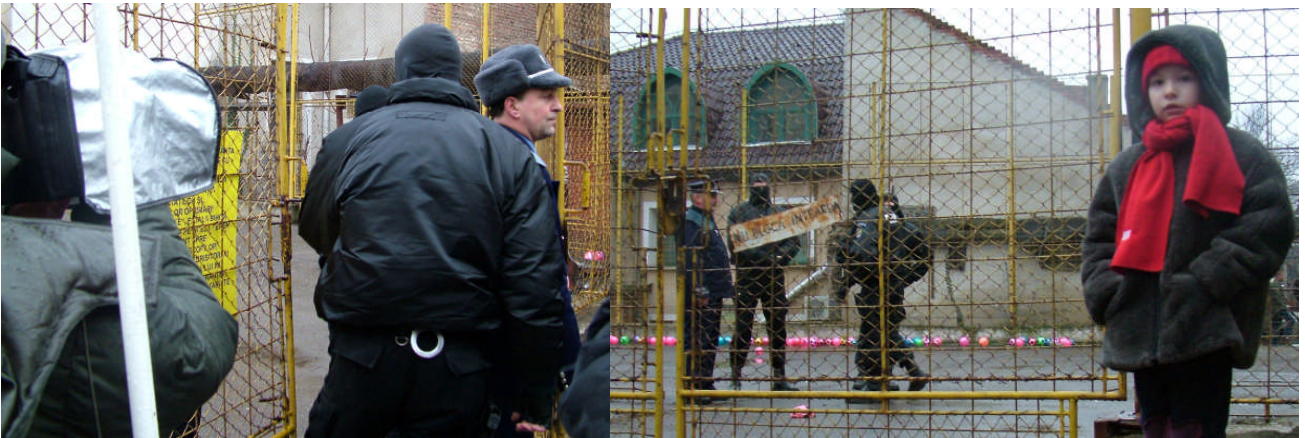
Masked anti-terrorists dispatched against children.